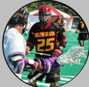
Frederic du Bois-Reymond